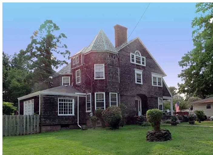
Figure 11. The property around 1980. The artifact had been moved to its found location (right foreground) and was completely surrounded by flagstones that had paved the paths of the former rose garden.