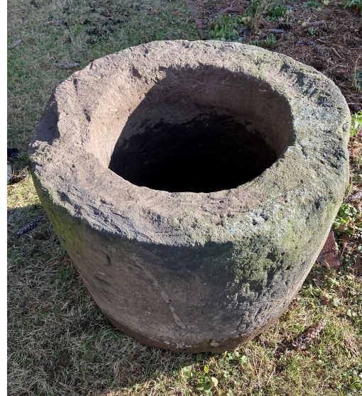
Figure 3. Top view