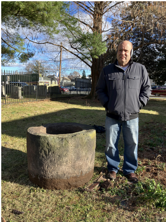
Figure 4. The subject in the photo is 5' 8" tall. The artifact is 2 feet 1 inch high (25" tall).