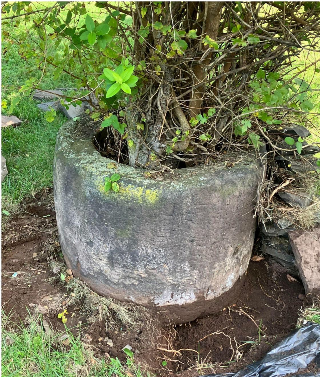
Figure 12. A minor excavation of the earth next to the artifact to determine whether its bottom was open or closed. The edges are all uniform and the artifact is a cylinder open at both ends.