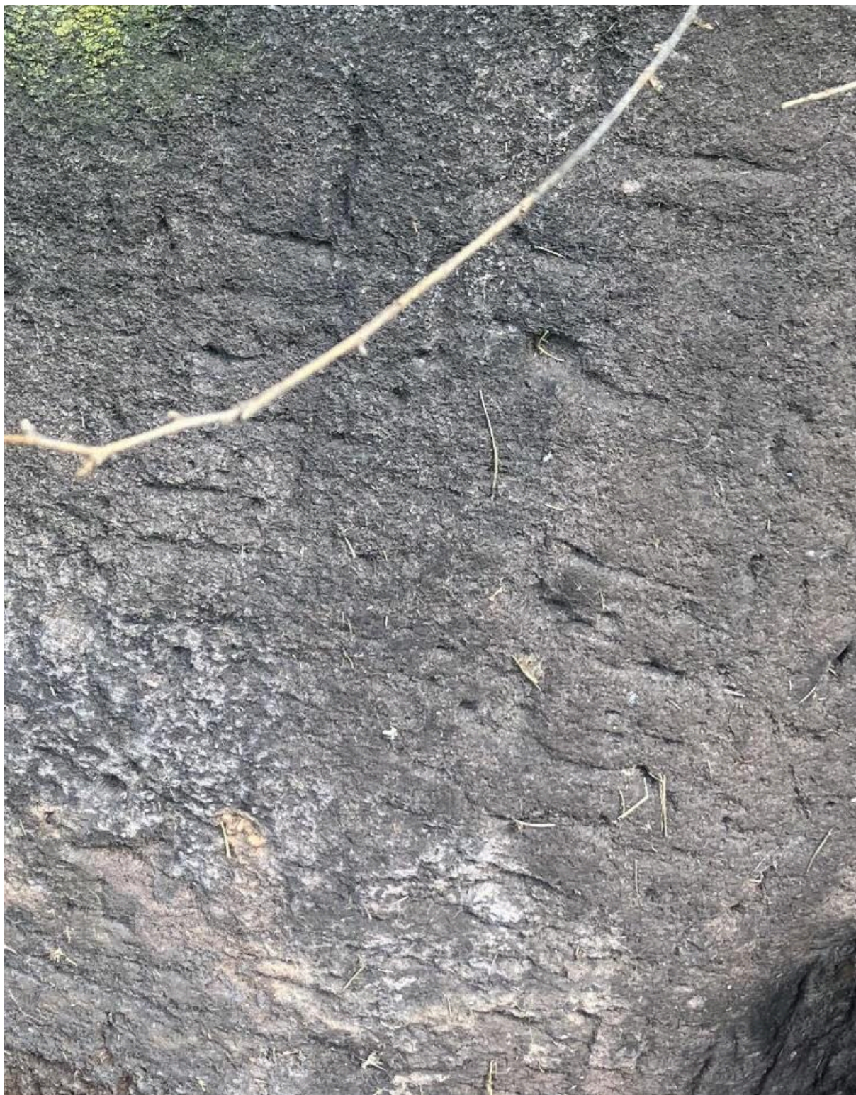
Figure 14. Exterior horizontal tool marks.