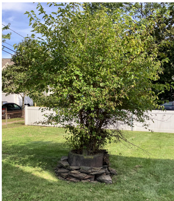
Figure 10. The artifact on September 21, 2023.

The artifact was noticed upon touring the property on September 6th, 2023, prior to its demolition. It had been moved from its place in the rose garden ( fig. 9 ) after that part of the property had been subdivided around 1980. It had a shrub growing completely throughout it and was filled with soil and several heavy pieces of flagstone. It was completely surrounded by pieces of flagstone that had paved the paths of the rose garden ( fig. 11 ).