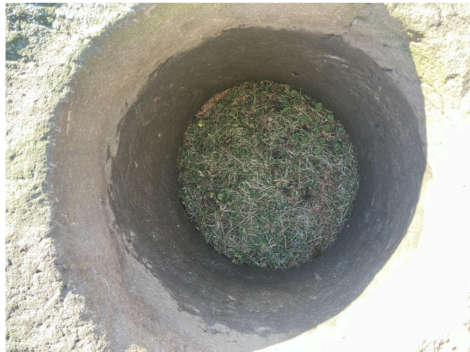
Figure 5. The inside of the artifact has been ground smooth relative to the rough exterior. The interior walls are virtually vertical. The dark lower area is still soaked with water from the soil removal.