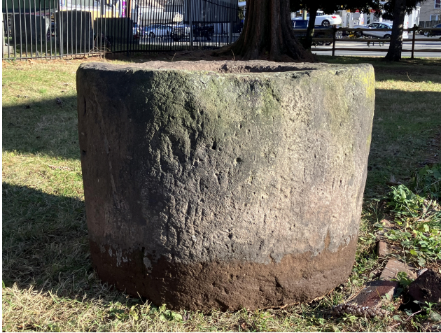
Figure 2. The artifact, 33' x 25" x 6".

The massive size of the half-ton plus artifact, cut by hand from a single piece of stone, the adze-like tool marks, interior grinding and exterior weathering, would indicate either a Native Indian or Early Colonial origin of significant age.