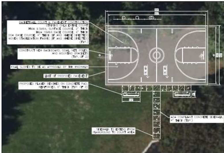
HOWARD FIELD PARK CONSTRUCTION PLAN